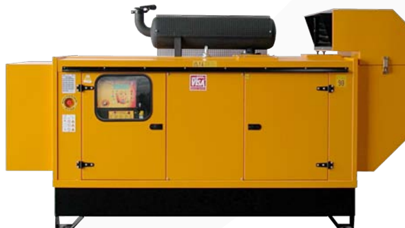
Mod. P 130 SS

-Air filter -Engine starter -Fuel pump -Fuel settler -Battery -Fuel filter -Oil filter -Oil extracting pump -Radiator expansion tank -Guard Evolution control panel -Circuit breaker -Earth fault relay (manual version only) -Fuel tank -Fuel plug -Key locks -Steel structure -Hot galvanized sheet steel -Thermo-set powder paint -Sound attenuating material made from polyurethane textile according to class 1 fire resistance norms -Insulation jacket on exhaust line -Lifting eye -Door gaskets with structural rivets (not adhesive), the same used in the automotive industry -External exhaust silencer with protection grills - Rain cap for exhaust muffler