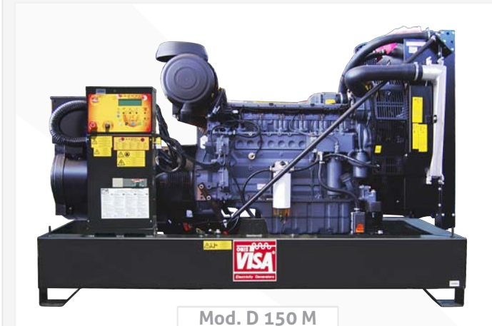
Mod. D 150 M