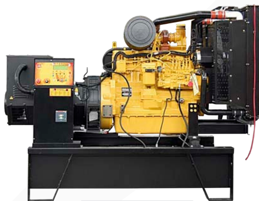
Mod. JD 250 B

-Air filter -Engine starter -Fuel pump -Fuel settler -Battery -Fuel filter -Oil filter -Radiator expansion tank -Guard Evolution control panel - Circuit breaker -Earth fault relay (manual version only) -Fuel tank (capacity depending on the model) -Fuel cap -Thermo-set powder paint -Exhaust muffler and flexible pipe supplied loose.